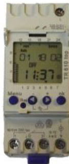
Part #1301007R (115V)