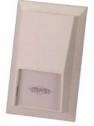
Part #1302024 (1 -heater)